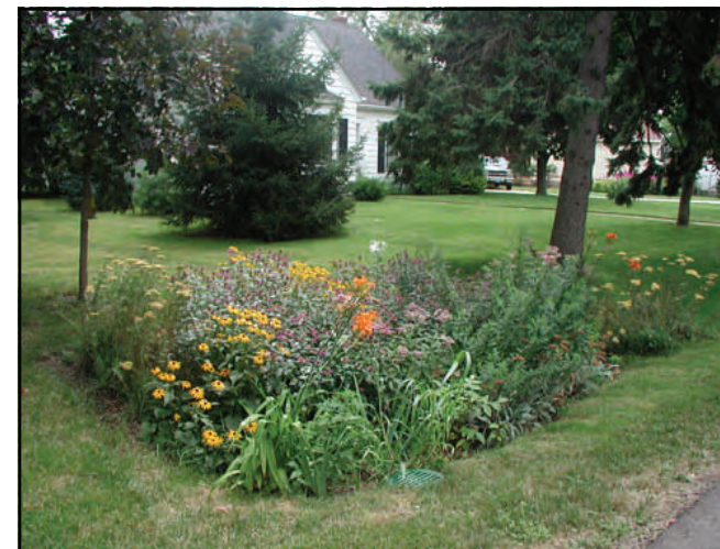
A rain garden example from the City of Maplewood, MN. Rain gardens provide native landscaping and attract wildlife.