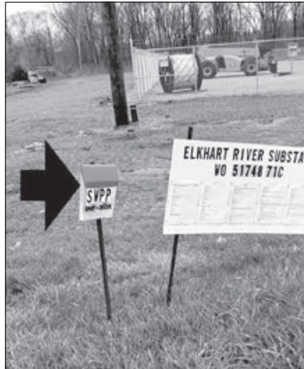
Notice of Sufficiency in document box