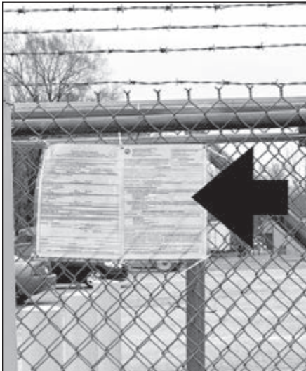
Notice of Sufficiency at project entrance

When considering your permit, make sure to understand the many requirements that go with it, to include how the physical document itself should be obtained and posted. This is not a comprehensive breakdown of this process, but it is some of the often overlooked aspects of the permitting process that should be brought to light.