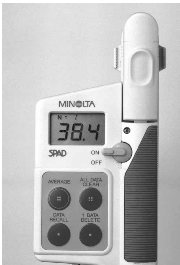
Figure 3. Picture of chlorophyll meter showing function buttons, display screen, and meter head.

Once the operator has become familiar with the meter operation and leaf stage identification, readings can be done very quickly. Since the meter will store up to 30 readings in memory and then calculate an average reading, at least 30 readings should be done. If a field is very variable, more readings may be necessary for an accurate field average or to determine if several different N rates would be appropriate for the field.