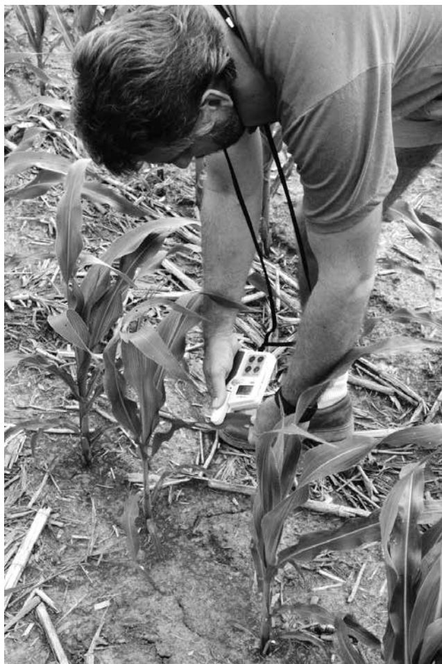
Figure 2. A chlorophyll meter in use.

CLEAR" button because this will remove all readings taken to that point. If you want to look over all your readings at any time, use the "DATA RECALL" button to scan the readings you have taken. Each time this button is pushed, the meter will cycle through the readings in the order they were taken. During the scan, you may use the delete button to remove a reading and then replace it by taking another reading.